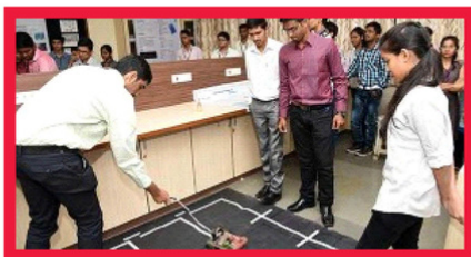
PRAKALP A Major Project Competition