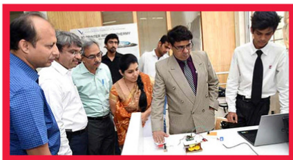
NAVONMESHA Mini Project Competition

10000+ Projects are completed every year by students